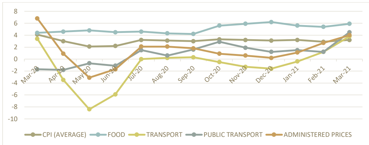
Figure 1: Consumer Price Index (CPI) and selected price categories | March 2020 to March 2021