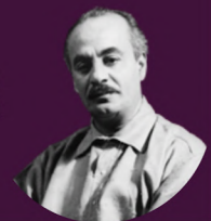
Khalil Gibran Writer & Poet

There must be something strangely sacred about salt, it is in our tears and in the sea.